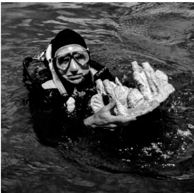
Figure 3: CORRT Reef Tiles and Nature Conservancy in Maine Project using Artificial Substrate in Maine for the first time. Image shows scientist in scubagear about to place the Reef Tile, The Basin near Phippsburg, Maine, 2017.

held in baskets has equivalent early spat attachment in all-round ratios as GROW's Artificial Reef Structures. These early findings for spat recruitment parallel our in-house assessments.