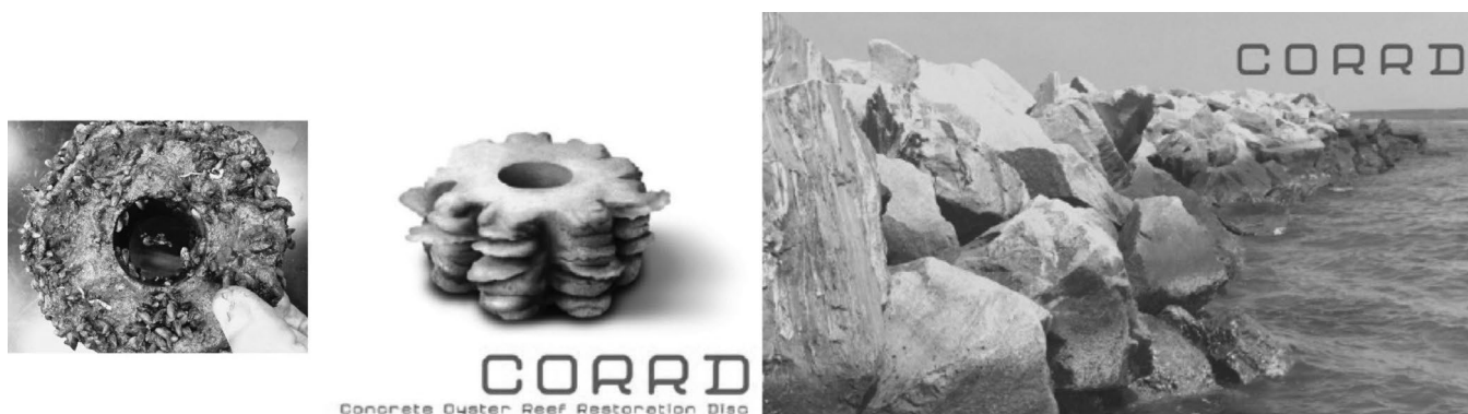
Figure 2: Concrete Oyster Restoration Disk or “Reef Disk” (l) Reef Disk after 3 months in water for the University of Maryland Project, Inner Harbor, National Aquarium Slip, Baltimore, Maryland, 2017; (m) Image of CORRD Disk (r) typical rip rap water break in the Chesapeake Bay showing red circles for placement of CORRD to turn the jetty into a “Living Breakwater.”